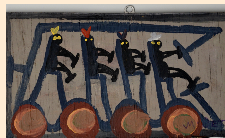
Mose "T", Children on Bus , Acrylic on Panel